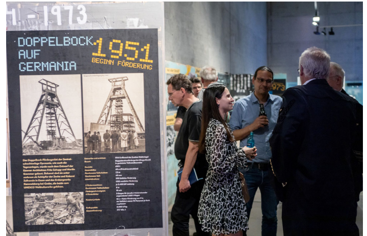
Fig 10. Opening night of the Special Exhibition "Doppelbock auf Museum"

The most important of these headframes from the Ruhr region has been the largest object in the German Mining Museum Bochum since 1974. At over 70 meters high and weighing 650 tons, it is also an unmistakable landmark of the city of Bochum. Originally, the headframe developed by Fritz Schupp and Martin Kremmer stood at the Germania colliery in Dortmund Marten from 1944 onwards. The colliery was shut down on May 14, 1971. Exactly 53 years later