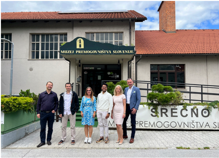
Figure 1. Participants of Congress Meeting in Velenje in front of The Coal Mining Museum of Slovenia

Velenje, Slovenia – Velenje Coal Mine, a partner in the CoalHeritage project, hosted a significant event on 29 th and 30 th May 2024 to discuss the development of an interregional network for promoting and protecting coal mining heritage in mining regions.