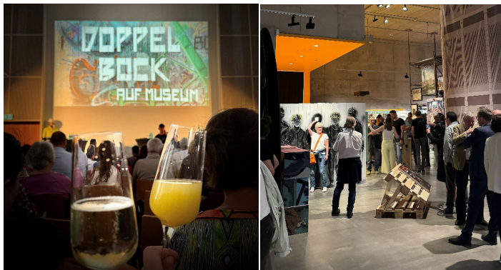
Fig 9. Opening night of the Special Exhibition "Doppelbock auf Museum"

Around 300 invited guests attended the opening event, including many colleagues, cooperation partners, media representatives, and state and local politicians. Numerous individuals from business and science also joined to celebrate the opening night.