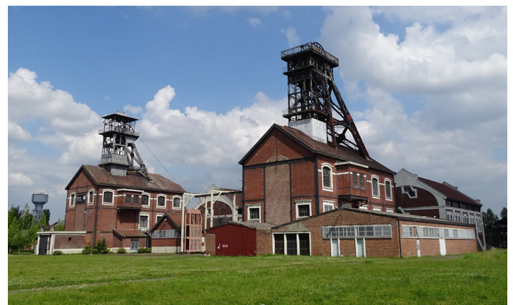
Figure 8. 9-9bis coal mining shafts, headquarter of the UNESCO mission of the Nord-Pas-de-Calais coal mining basin

Thanks a lot for their warm welcome! (P. Kusior and L. Gigault - Parc Explor Wendel - L. Piralla,