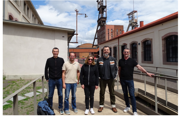
Figure 7. BRGM Team & Parc Explor Wendel Staff

BRGM team met the director and colleagues of the Parc Explor Wendel ( https://parc-explor.com ) based in Petite-Rosselle, Lorraine, as well as the director and colleagues of the Lewarde Historical Mining Center ( www.chm-lewarde.com ) in the Nord-Pas de Calais mining basin, and the director of the UNESCO mission for this coal mining basin, which has been a World Heritage site since 2012 ( www.missionbassinminier.org ).