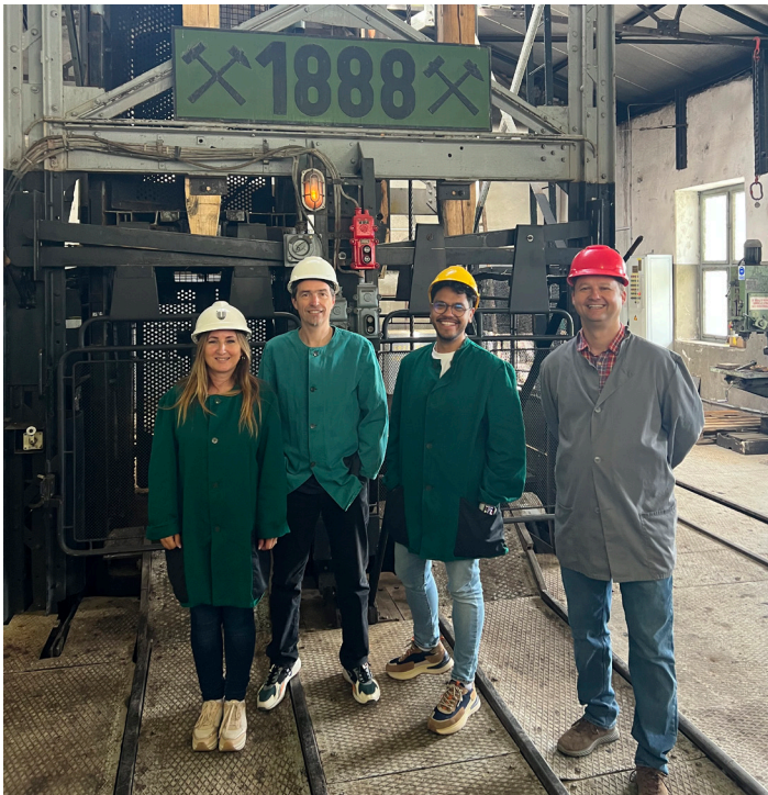
Figure 4. During their working visit, guests also visited the Coal Mining Museum of Slovenia, the subsidence remediation area, and the Velenje Museum.

in preserving Slovenia’s coal mining history, promoting education, and supporting sustainable development.